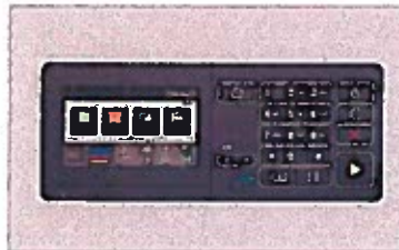
Easy-to-use 4.3" touchscreen with tablet style menu.