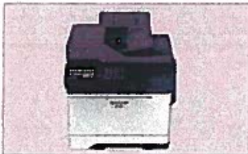
Standard desktop configuration shown.