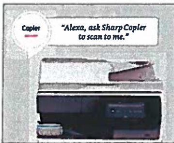
Available Sharp MFP Voice Feature with Amazon Alexa.