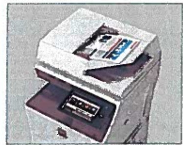
Sharp's ImageSEND™ feature provides one-touch distribution to email cloud applications and more.