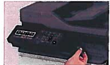
Front USB port for easy direct printing from memory devices.